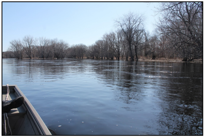
View from the northeast of the location for the DF-02b strategy.