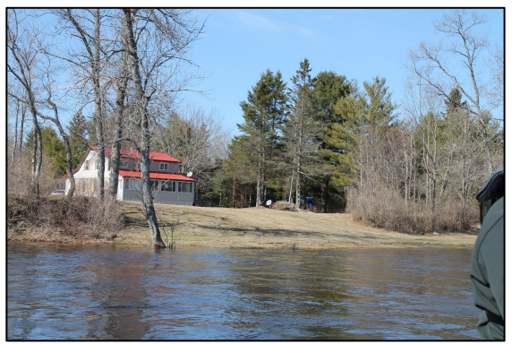
Shore anchor point for north portion of DF-02a.