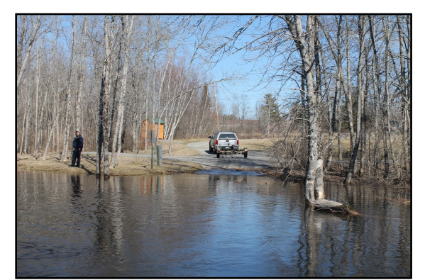
Boat ramp in Winn, ME. Site of DV-01 (left side of photo/upriver).